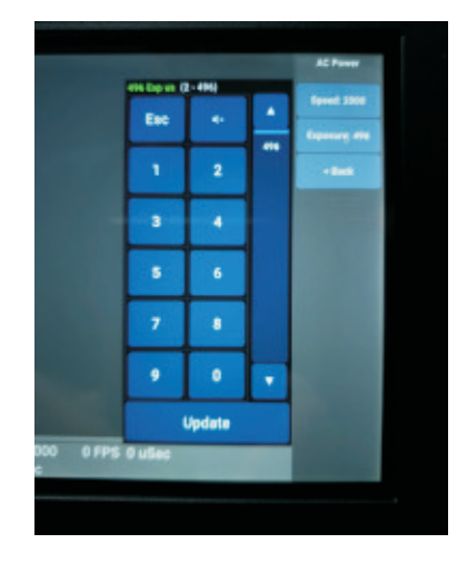
EXPOSURE TIMES SETTINGS MENU