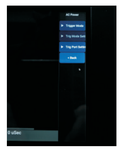
TRIGGER MODE SETTINGS MENU