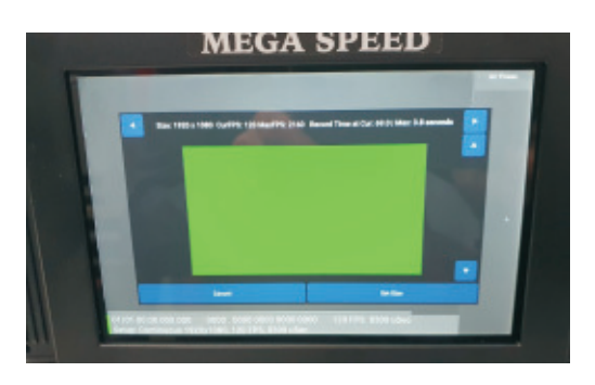
CUSTOMS IMAGE SIZE SETTINGS MENU