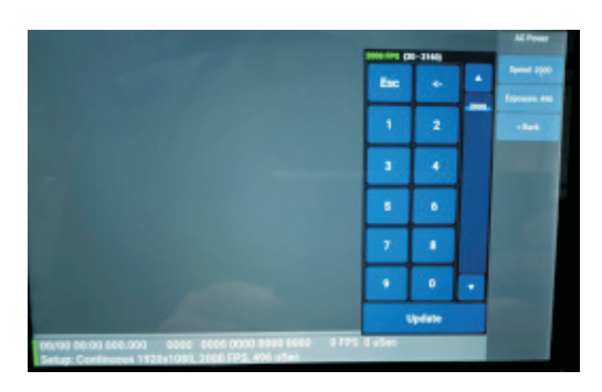
RECORDING SPEED SETTINGS MENU