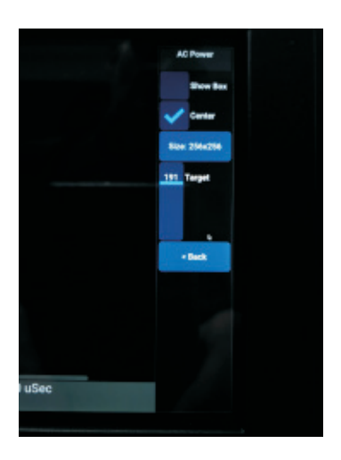
AUTOMATIC EXPOSURE CONTROL MENU